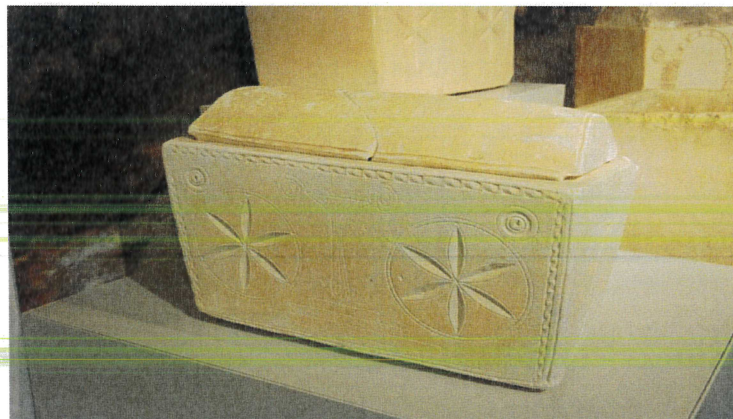
Ossuary of the Caiaphas family, from Jerusalem, 1 st century AD:

“For their fathers treated the prophets in the same way” Luke 6:23