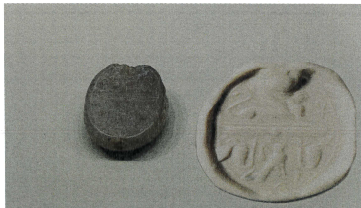
Jezebel seal, opal, 9 th -8 th century BC: Jezebel was a notorious persecutor of the prophets of the Lord. This seal dates to the period she lived in the northern kingdom, but cannot be positively identified with her. It was photographed in the Israel Museum.

WE’RE SO THANKFUL YOU STAYED SAFE DURING THE STORM. WHILE WE WEREN’T ABLE TO GATHER, THE CHURCH BUILDING STILL NEEDED CARE—HEAT RUNNING AROUND THE CLOCK AND FAUCETS DRIPPING THROUGH THE FREEZE. IF YOU MISSED YOUR OFFERING LAST WEEK AND WOULD LIKE TO MAKE IT UP, THAT WOULD BE A REAL HELP AS WE RECOVER FROM THESE WINTER EXPENSES. AS ALWAYS, THANK YOU FOR YOUR FAITHFULNESS AND LOVE FOR OUR CHURCH.